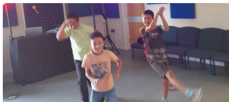
Photos Right: Summer activities from Young Shrewsbury as part of the HAF summer programme