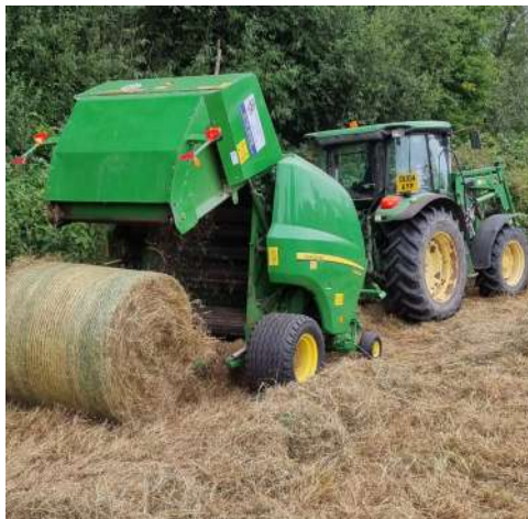
Photos: Haymaking at Column Meadows

We use tractors for speed and efficiency, but the process is basically the same as it has been for hundreds of years.