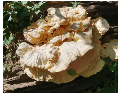
Chicken of the woods at Copthorne Park

Disclaimer: Never eat any plant, berry or fungi unless you are sure of its identification.