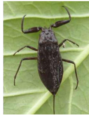
Photos Left: The water scorpion found at the Old River Bed SSSI