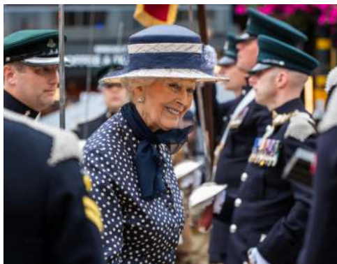
Honorary Colonel, HRH Princess Alexandra inspecting the Royal Yeomanry

Regiment at the Castle before they marched through the town. We were delighted to recognise the work of the Army Reservists and this honour is in recognition of the long association and cordial relations which have existed between the town and the Regiment and the work of the