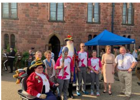
The Queen's Baton Relay at Shrewsbury Castle.

The baton arrived by helicopter at Shrewsbury Sports Village in Sundorne, before the relay started from the Flaxmill Maltings and included a ride on Sabrina boat and a visit to Pengwern Boat