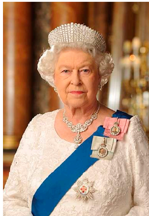
QUEEN ELIZABETH II 1926-2022