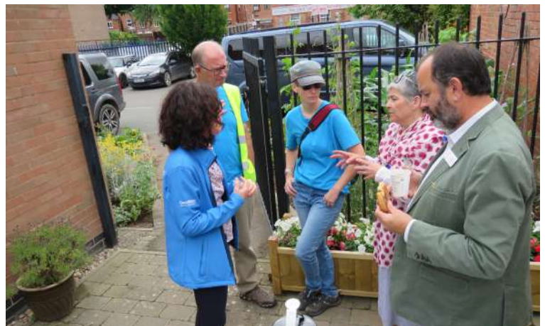
The Heart of England in Bloom judges paid a visit to the Barnabas Centre in Longden Coleham to find out how they help local people