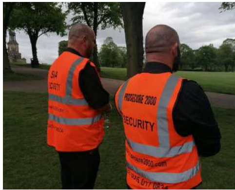
Prosecure staff on duty in the Quarry