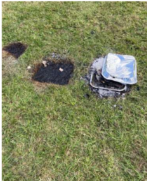
The dangers of extreme heat from disposable BBQs can scorch dry grass and cause fires

Please also be aware if you are using them inside a tent or caravan, as they emit an odourless, tasteless and colourless gas which can be very