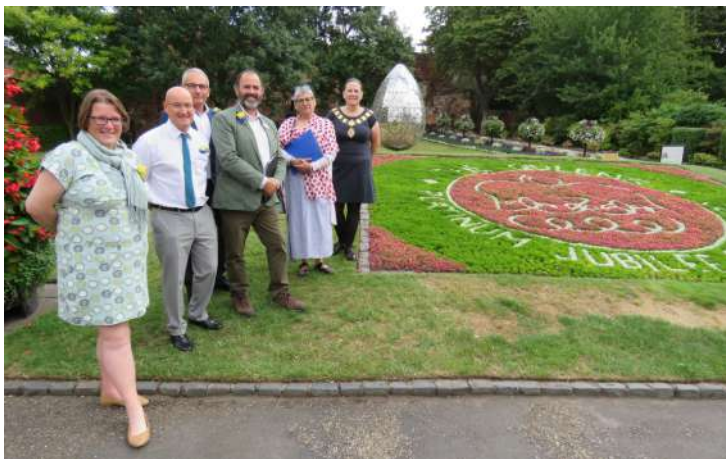
Shrewsbury in Bloom welcomed the Heart of England in Bloom judges at the Castle

The results will be announced at an awards ceremony in mid-September in Sutton Coldfield.