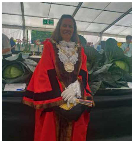
In full Mayoral regalia at the Shrewsbury Flower Show in August

They do a fantastic job and are always on the lookout for canned food donations.