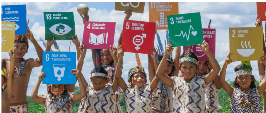
Photo: Climate Change is never very far from our thoughts.

We often cut grass up to Christmas but then have terrible rain in the early months of the year resulting in flooding. We are experiencing baking temperatures in the summer that affect the type of plants we grow and the need for sustainability and resilience is very strong.