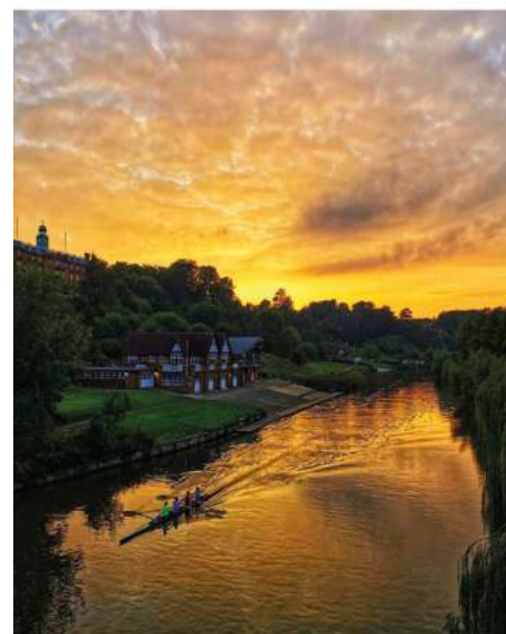
Front cover of the 2022 Shrewsbury in Bloom Portfolio

With special thanks to all those organisations, companies and individuals who contribute to Shrewsbury in Bloom, helping to improve the quality of life for visitors, residents and those who work in the town.