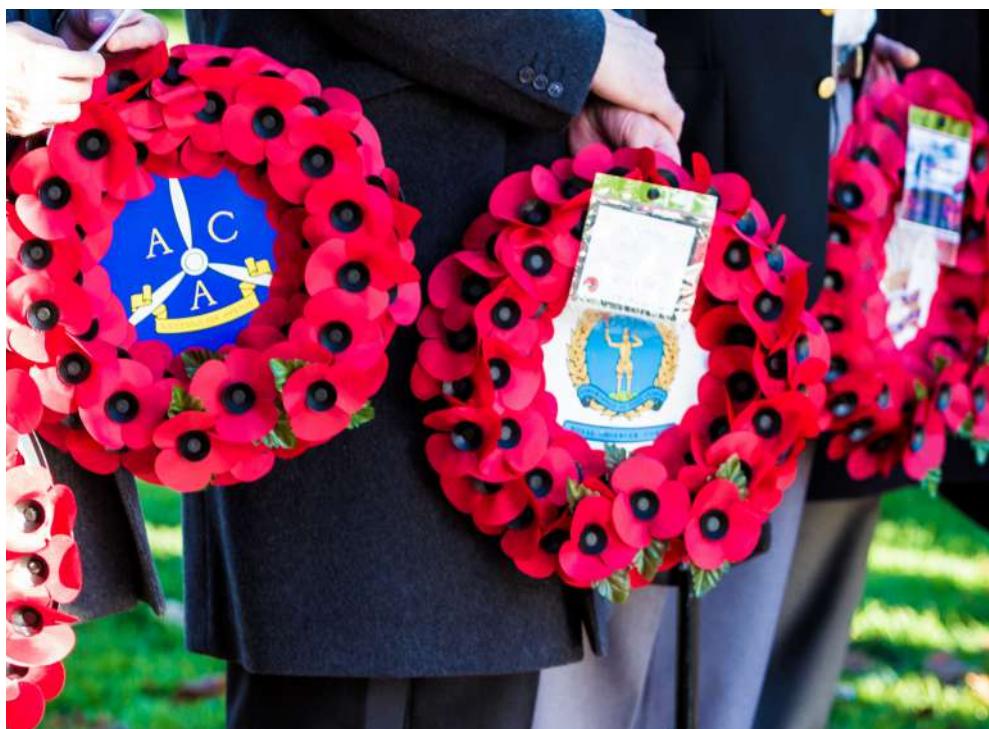
Photo: Remembrance in Shrewsbury

On conclusion of the wreath-laying, the Mayoral party will move to the saluting dais on St Chad's Terrace, following which there will be a march-past and salute.