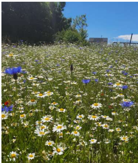
Photo: Our wildflower meadows have been well-received by residents.

- Resurfacing and lighting for Monkmoor Recreation Ground tennis courts along with renewal of the 3G pitch.