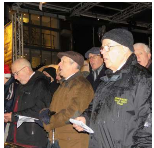
Photo: Members of Shrewsbury Male Voice Choir at our Carols in the Square event.