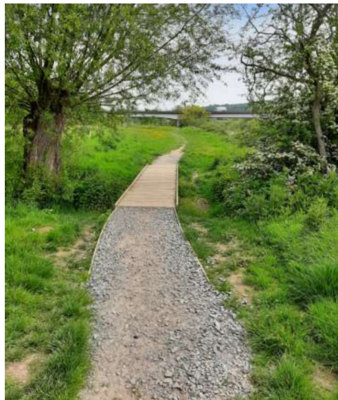
Photo: Work has been undertaken at Monkmoor Meadows to help improve footpaths

- The Monkmoor Meadows project, with footpaths and landscaping, has been widely acclaimed.