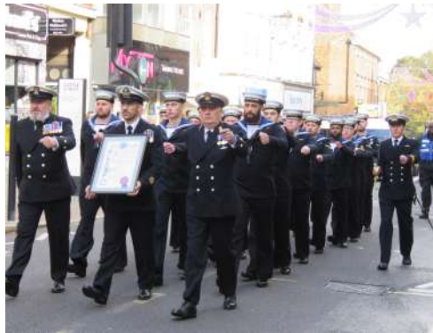
Photo: Crew from HMS Talent march from Shrewsbury Castle through the town towards the Square