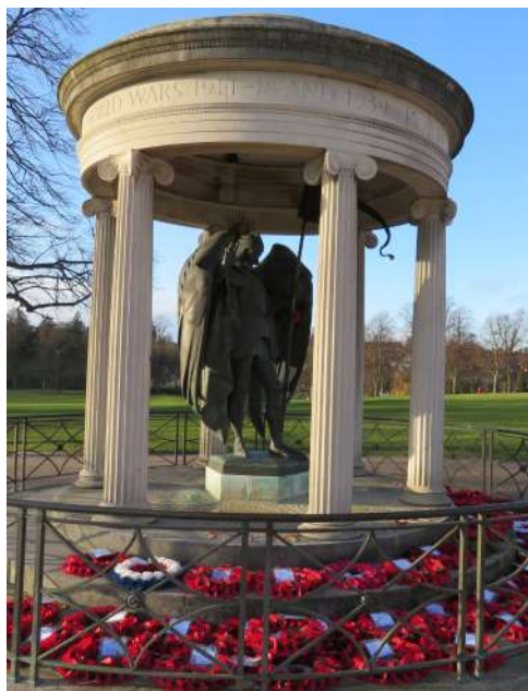
Photo: The War Memorial in the Quarry

A Memorial Service will take place in the Quarry at the War Memorial at 10.45am, Buglers will sound Last Post, which will be followed by two minutes' silence and Reveille, after which wreaths will be laid.