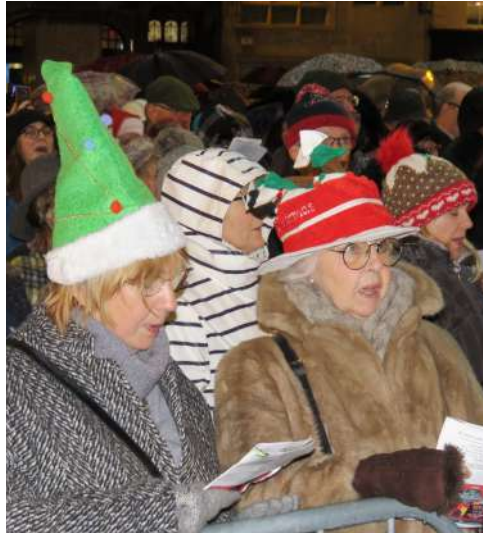
Photo: come along and join us for our Carols in the Square event next month.

The concert will also be available to watch on-line thanks to Shrewsbury-based company,