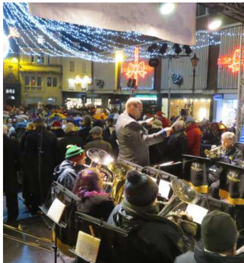
Photo: Shrewsbury Brass Band providing the music for our Carols in the Square event.