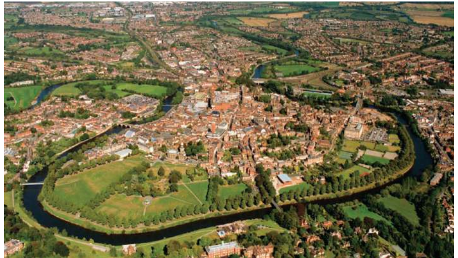
Photo: Shrewsbury Town Council has established an ambitious Capital Programme to improve the facilities within the town.

This has been possible by sound management of our own capital and revenue resources, working with developers to maximise the value of their contributions, careful investment of the Community Infrastructure Levy and with a commitment to partnership working. We also have excellent management and operational staff to ensure that all resources are