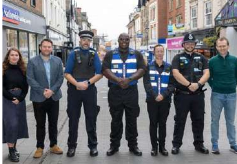
Unveiling the new Street Rangers for Shrewsbury.

Funding from Shrewsbury BID, Shropshire Council and West Mercia Police Safer Streets project has been secured to provide the rangers at various times during the day and evening over five days a week.