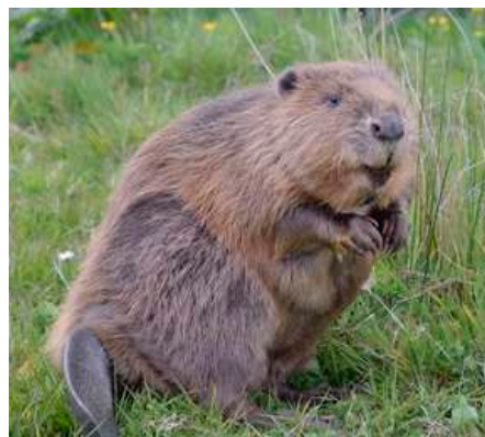
Beavers have been reintroduced as part of the Cornwall Wildlife Trust project

- The Beaver Project in Bagley, where we are working with the Shropshire Wildlife Trust, and other partners, to reintroduce beavers onto the Old River Bed to help protect it as a Site of Special Scientific Interest