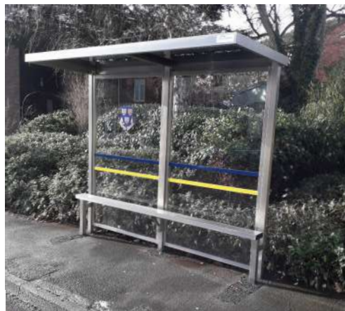
Photo: New bus shelters are being installed in Shrewsbury

As part of our agreed capital programme of works, the first seven of the new structures have been installed on Abbey Foregate between the Abbey and Column Island. Welshpool Road, Belle Vue and Sundorne will also see new structures installed.