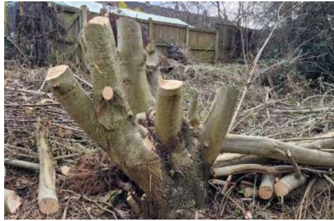
Photo: Damaged trees in the Rea Brook LNR from illegal felling

to other members of the public as well as to the individual concerned."