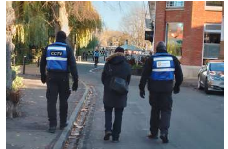
Photo: Quarry security at work

of those vulnerable people on the streets.