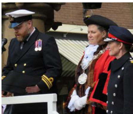
Photo: The Return of Freedom Rights in the Square, October 27, 2023

I was fortunate to be able to travel to Plymouth in May last year when the official decommissioning of the submarine took place led by Her Royal Highness The Princess Royal.