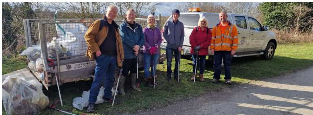
Photo: Volunteers joined our Countryside and Greenspace Team to collect litter at Pimley Woodland