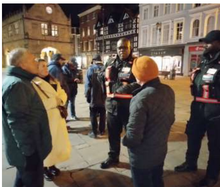
Photo: Showing the Purple Flag judges around Shrewsbury

I spent the night escorting the Purple Flag Judges around the town. We have the biggest night-time economy of any town west of Birmingham and more licensed premises in such close