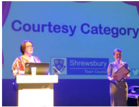
Photo: Mayor's Awards 2022 in the Walker Theatre