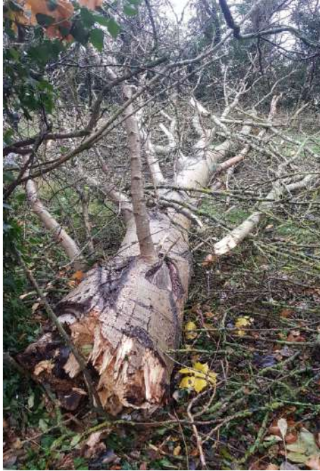
Clearing up damage after Storm Arwen

Due to the volume of work involved, they had to deal with jobs on a priority basis, starting with trees blocking roads, paths or posing a high risk to people and property.