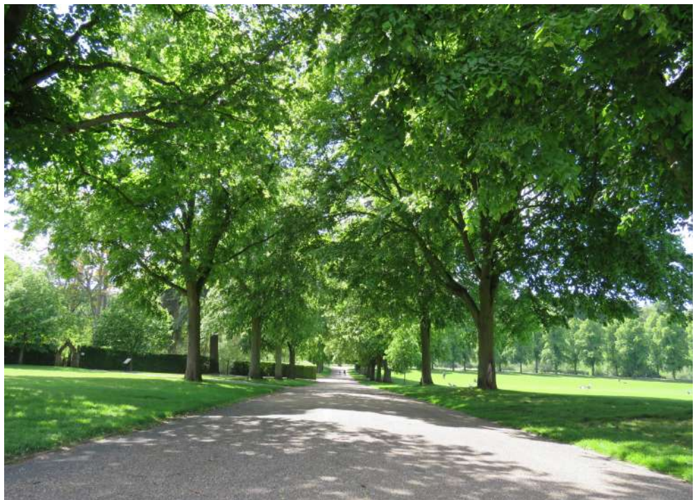
With around 250 lime trees in the Quarry, a regular programme of maintenance is required to ensure their longevity

Shrewsbury Town Council Tree Management Policy