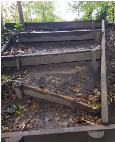
Work on the steps by the Green Bridge in the Reabrook, between Malvern Close and White Hart.