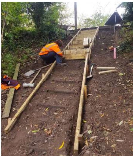
The Countryside Unit working on steps at one of their sites

Our staff have been improving access to the steps at our Nature Reserves around the town.