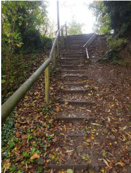
Work on the steps by the Green Bridge in the Reabrook, between Malvern Close and White Hart.