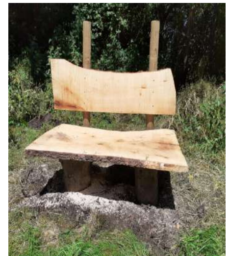
One of new Rustic benches installed by the Countryside & Greenspace Team