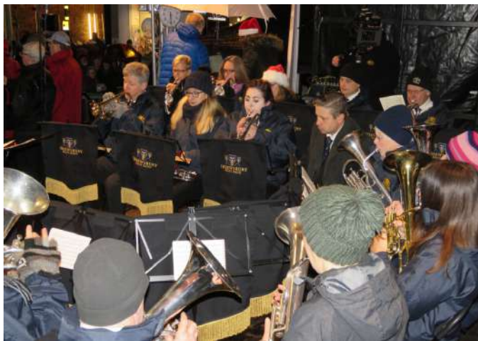
The annual Carols in the Square, broadcast on BBC Radio Shropshire and on the internet

Nevertheless, it was a pleasure to welcome a good number of people to 'Carols in the Square' which was, as always, a joyous affair.