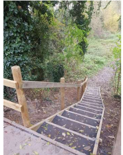
Completed work on the steps by the Green Bridge in the Reabrook, between Malvern Close and White Hart.