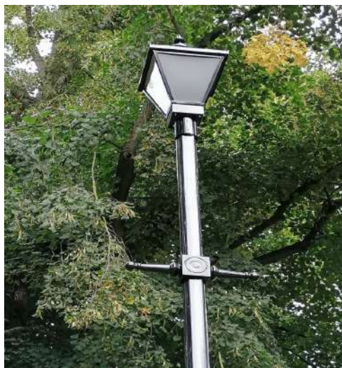
The new heritage solar lamps in the Quarry

"These new lights will mean that the path from Porthill Suspension Bridge to Grey Friars Bridge will