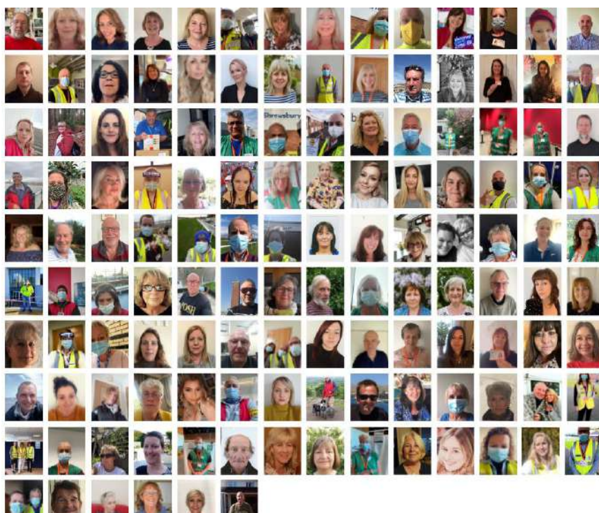
who acknowledged the hard work of a number of local volunteers earlier this year