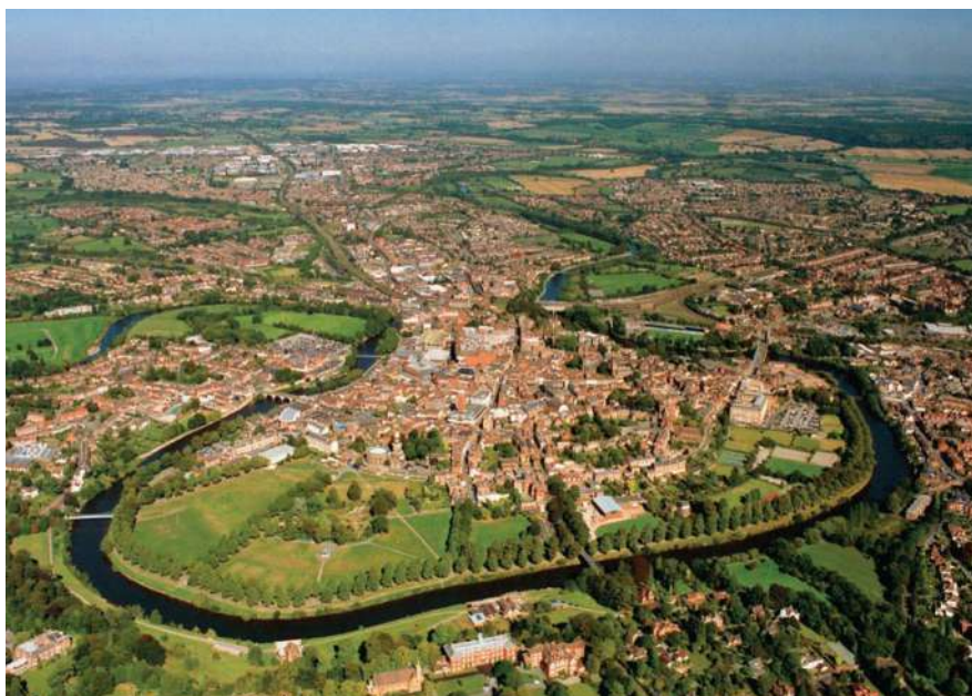
The Town Council declared a climate emergency in 2019, setting plans to become carbon neutral by 2030

"We also need to engage more with our local communities to enable them to do their bit as well by providing information and practical support on how they can play their part with a wider Climate Emergency Action Plan."