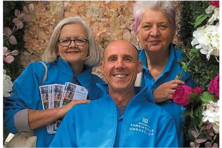
Ambassadors will be in the town centre at weekends until 26 September

The ambassadors will be easy to spot in their eye-catching uniforms and will provide visitors with maps, guides and information.