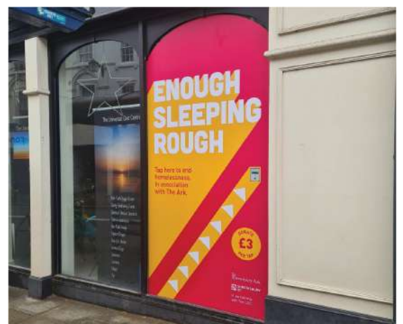
Donations can be made directly to The Ark using these new machines set up in the town centre

For those who prefer to donate cash secure cash donation boxes are also available at the railway station, the Square and Frankwell Footbridge.