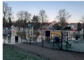
Flooding in the Quarry

February 2020 and again in 2021 saw torrential rain and the river burst its banks to 1 in 100-year flood scenarios. Residents and businesses were equally affected. Parks and open spaces were, in places, under 12 feet of water and this affected utilities, CCTV systems and telecommunications. Flooding also affected the road network and, on a number of days, Town Council staff were on call to support Shropshire Council and Emergency Services in keeping people safe. I never fail to be surprised in how resilient some of our spaces are. Within a few days of flood water receding, you would never believe there had ever been any flooding.