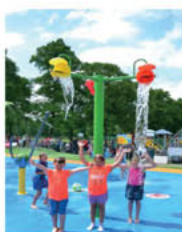
The Quarry Splash Park

PUBLIC FIELDS & OPEN SPACES — The Town Council looks after the majority of playing fields, recreation grounds and open spaces in Shrewsbury. In addition, we keep over 120 miles of highway verges and hedges trimmed and look after in excess of 30,000 trees throughout the town. We also manage more than 250 acres of Countryside Land within the town boundary. Many of these sites are Special Sites of Scientific Interest, Local Nature Reserves and Community Woodlands.