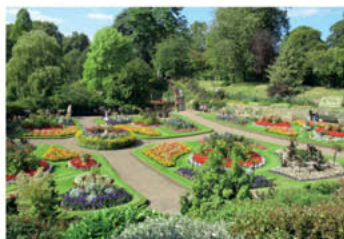
The Award Winning Dingle

SHREWSBURY IN BLOOM — Shrewsbury is famous for its horticulture and the majority of the floral displays are the responsibility of the Town Council and its dedicated Grounds Maintenance Team. More than 300,000 blooms are grown in our own Greenhouse each year, with 30,000 plants alone being used for the town's centrepiece in the Dingle, which won the Horticultural Excellence in the 2016 Heart of England in Bloom Awards.