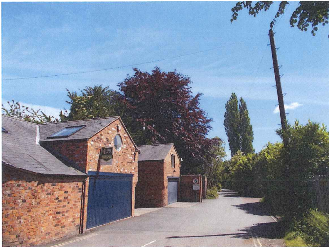
Tree from corner of Crescent Lane looking west