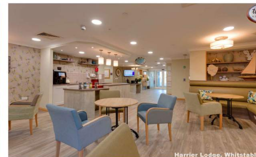
Harrier Lodge, Whitstable