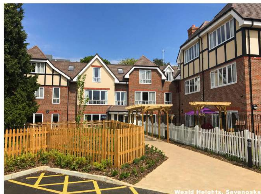
Weald Heights, Sevenoaks

Care UK's nursing care teams are fully qualified and have the specialist expertise required to care for residents' varying medical needs and requirements. Residents include those who may be living with conditions such as Parkinson's Disease, Multiple Sclerosis or Motor Neurone Disease; others may have suffered a brain injury as a result of an accident.