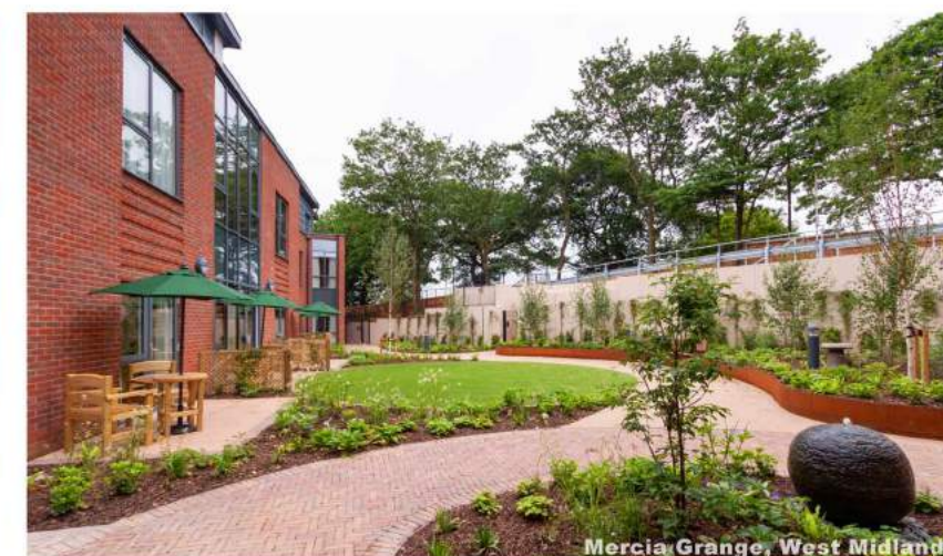
Mercia Grange, West Midlands