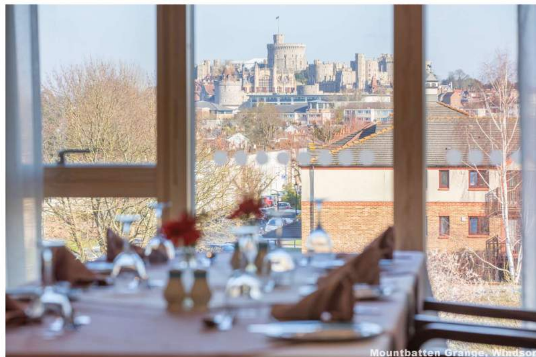
Mountbatten Grange, Windsor