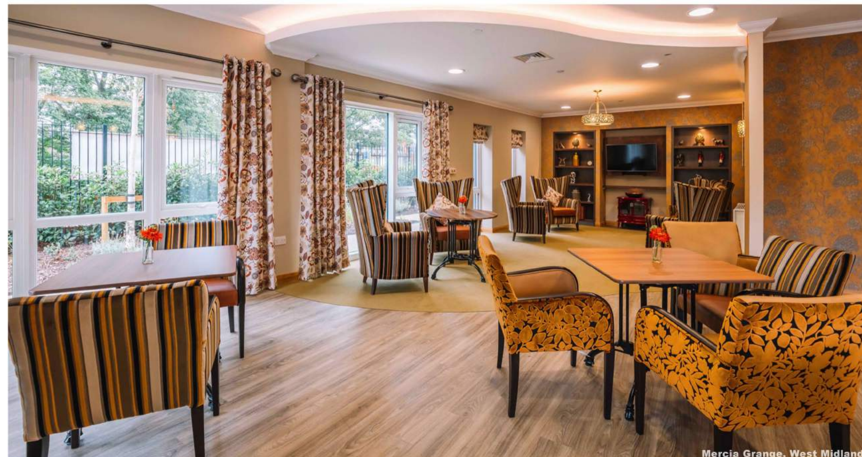
Mercia Grange, West Midlands