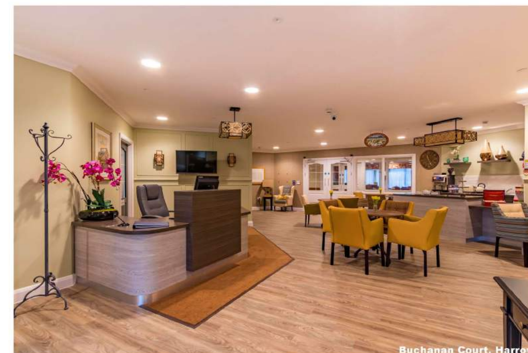
Buchanan Court, Harrow