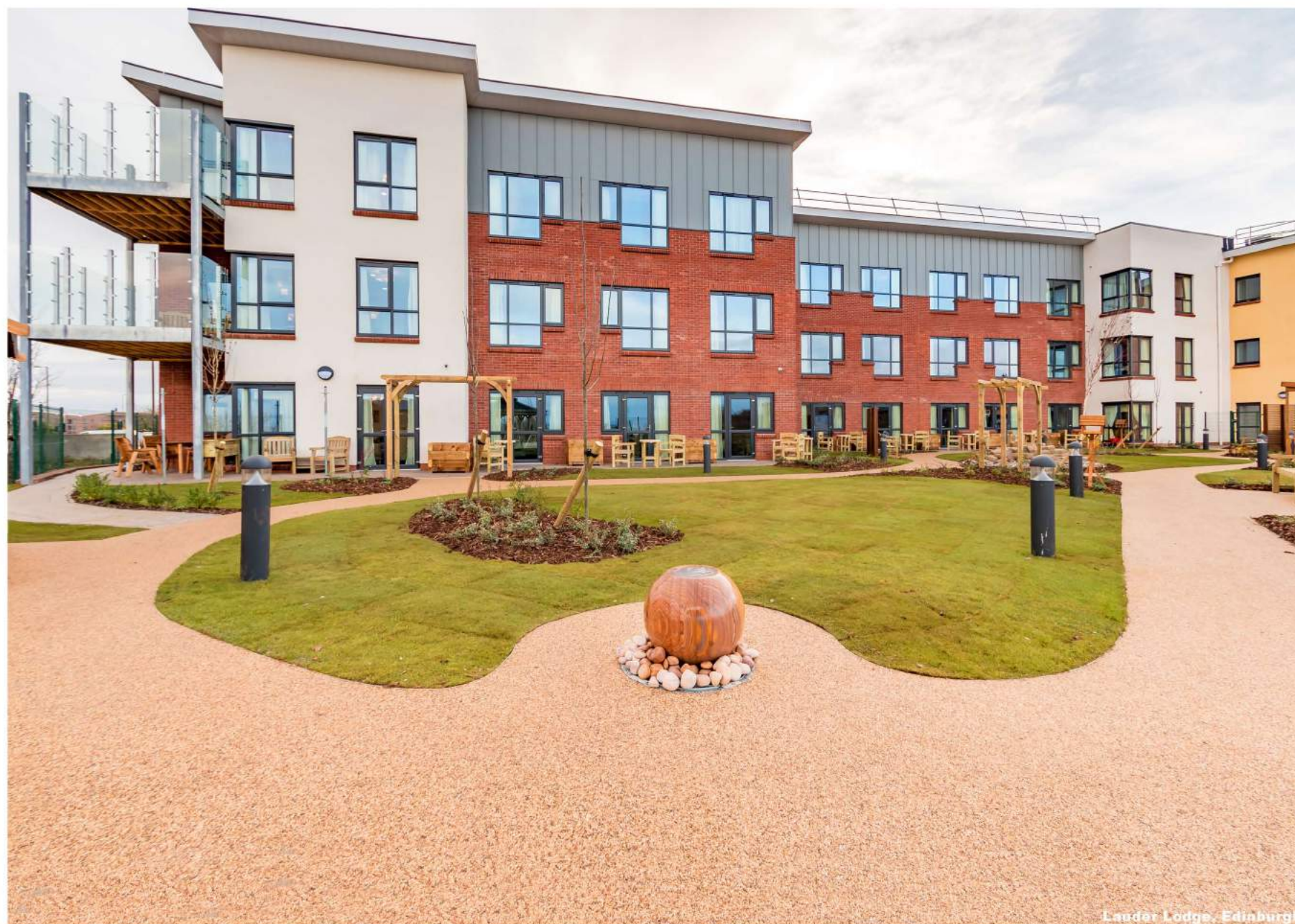
Lauder Lodge, Edinburgh