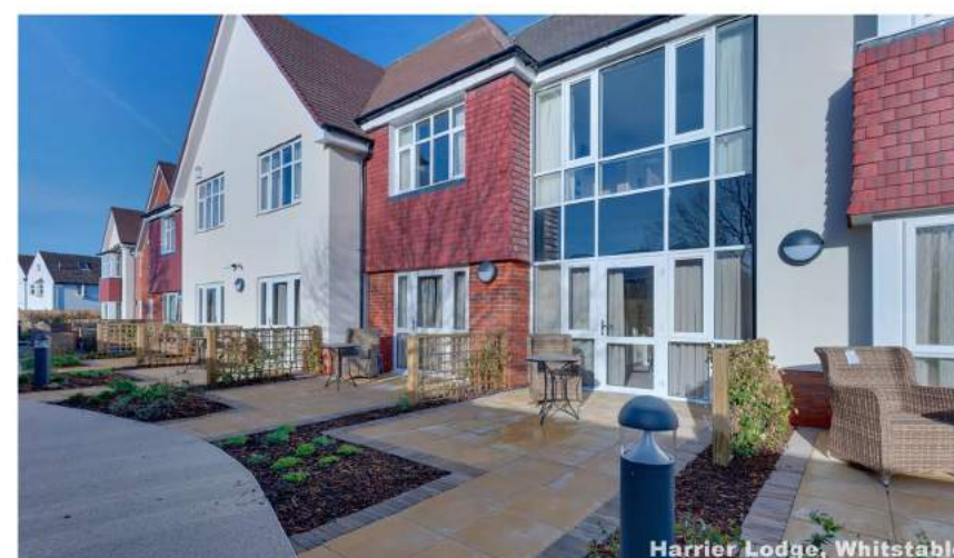
Harrier Lodge, Whitstable