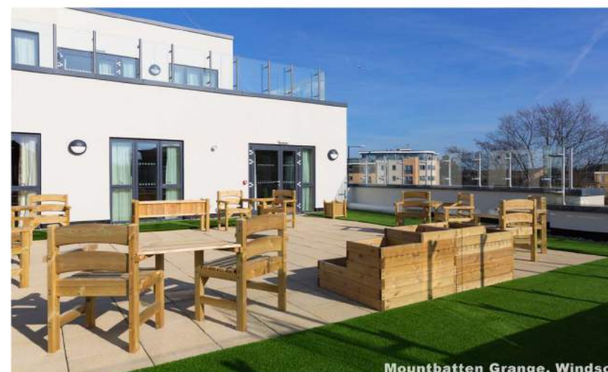
Mountbatten Grange, Windsor