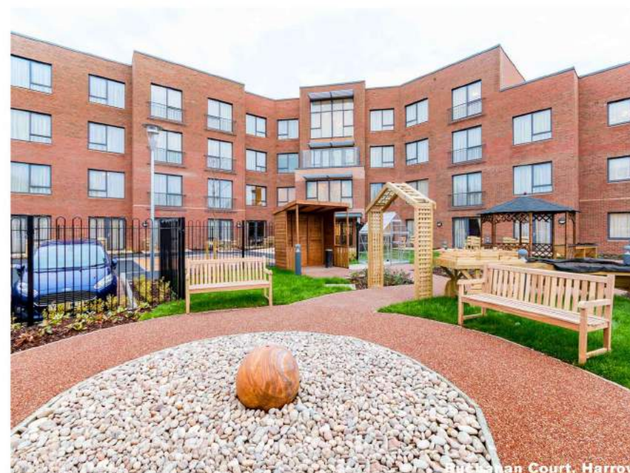
Buchanan Court, Harrow