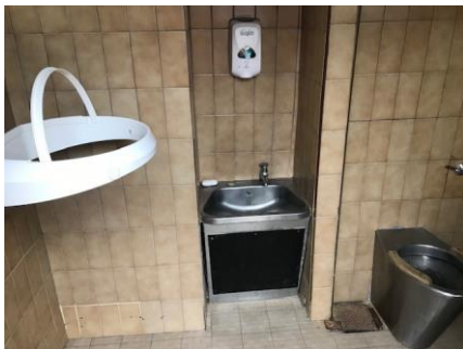
(Sydney Avenue Ladies)