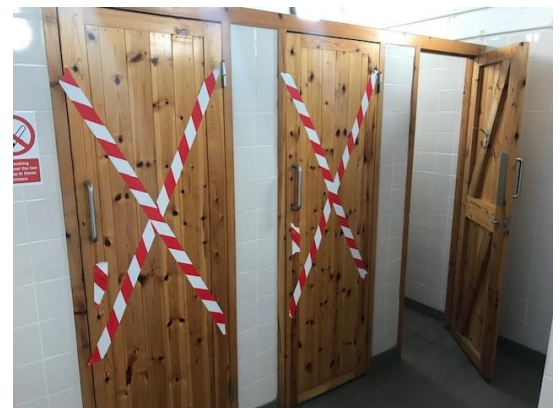
(Abbey Foregate Ladies, Gents, Ladies)