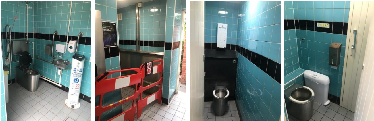
(Upper Quarry Disabled, Gents, Gents, Ladies)