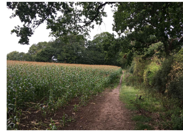
C Retain public footpath around perimeter of site. Shelton Rough is shown to the right of this view