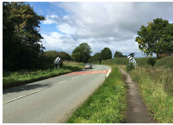
A View north west along Holyhead Road to where roundabout to North West Relief Road is proposed