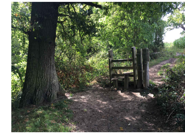
E Retain public footpath around perimeter of site. Shelton Rough is shown to the left of this view