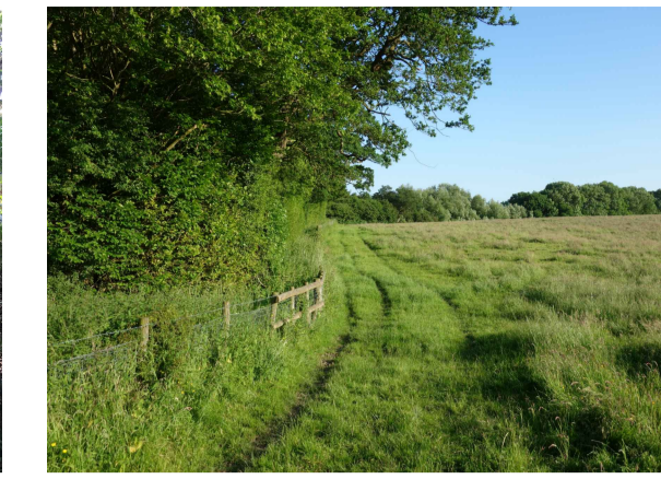
F View along northern boundary of site showing extensive screening offered by woodland planting