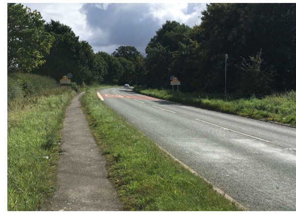
B View south east along Holyhead Road to where roundabout to North West Relief Road is proposed