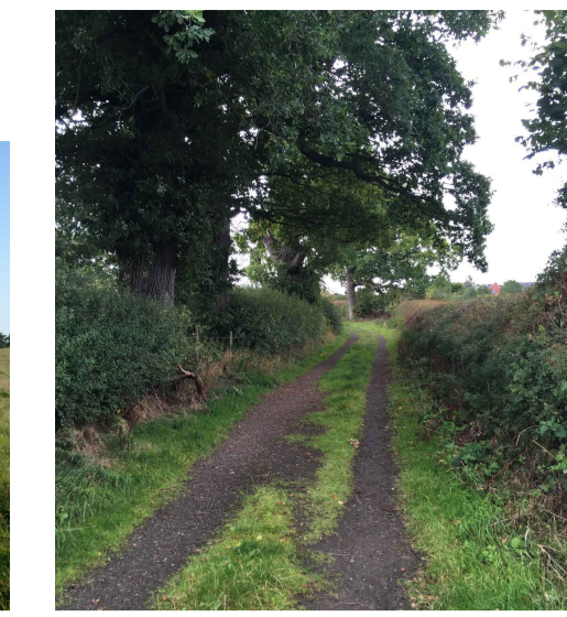
G View along Featherbed Lane showing wildlife corridor with mature planting