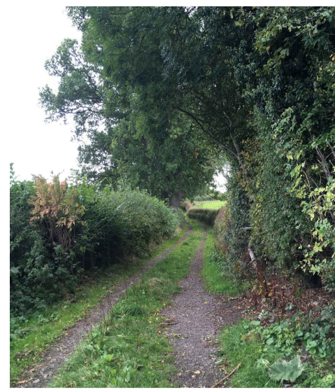
H View along Featherbed Lane showing wildlife corridor with mature planting