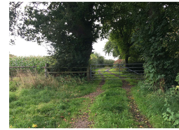
D View of Featherbed Lane near to Water Borehole. Proposed Public Open Space around this location