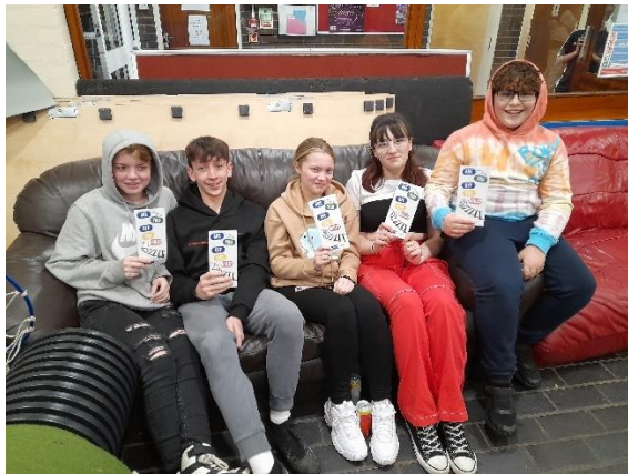
Sundorne Youth Group