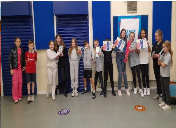
Grange Pre-juniors Group