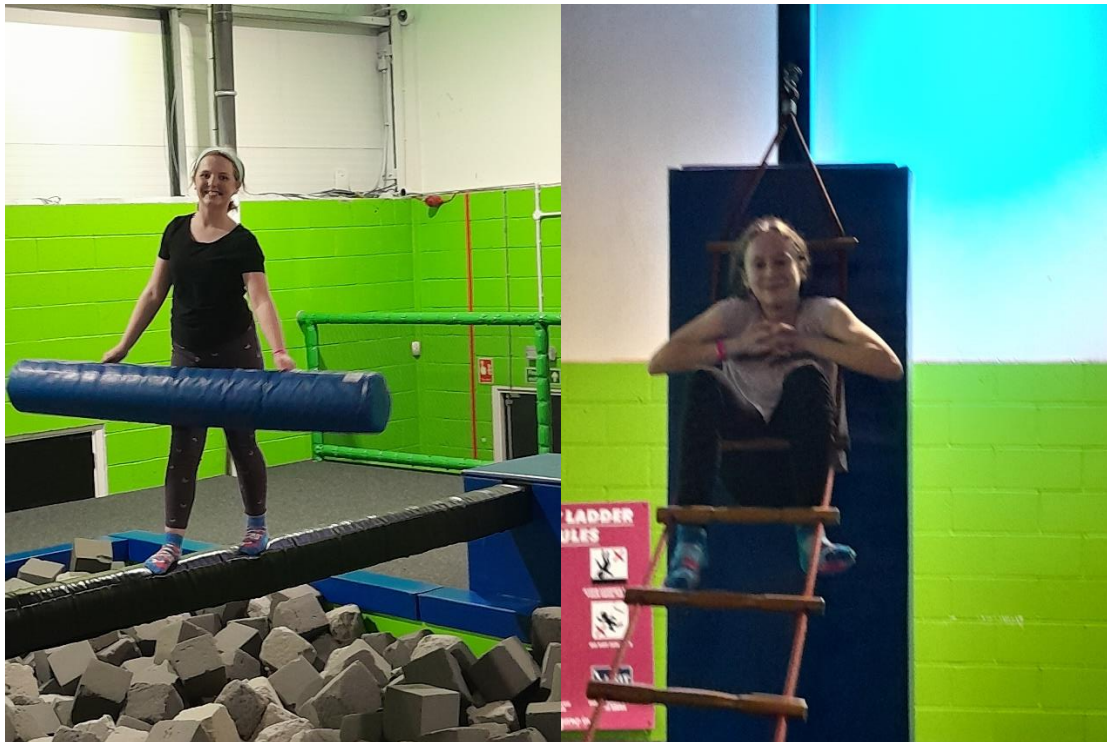
Hive Group at Jump-In!